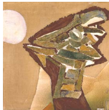
Moonstruck Goat, 1957