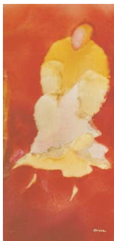
She Dances, 1968