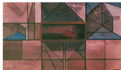
Javits Center Abstracted, 1986

Now find one with a different texture. Explain the differences between them. _____