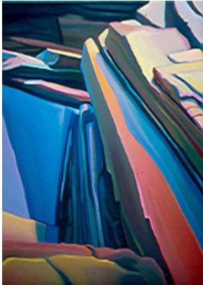
On left: Barbara Postel, Point Pleasant , oil on canvas, 1989, photo courtesy James A. Michener Art Museum library

The Michener Art Museum also has paintings in their collection created by women artists who painted in the same style or during the same time period as Frankenthaler. Below are a few of these paintings. What similarities do you notice between these paintings? What are the differences? Which styles do you like the best?