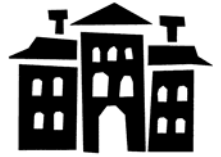
Image Credits: Ada and the Mirror , 1991, Selma Bortner (b. 1926), linoleum print, H. 30 inches x W. 36 inches, James A. Michener Art Museum, Purchased with funds provided by an anonymous donor from the Bucks Biennial I Exhibition