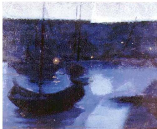
Charles Coiner, Harbor , oil, 11 x 13